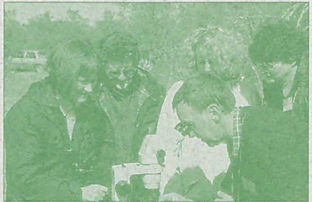
Non-vascular plants come alive under the microscope.

A study commenced recently to examine the distribution of non-vascular plants inside and outside a number of exclosures in western NSW. Preliminary results have indicated that species such as the lichens Acarospora reagens , Caloplaca spp. and Xanthoparmelia spp. are more common inside exclosures where disturbance is minimal compared with adjacent disturbed surfaces. These studies suggest that some species of non-vascular plants may be susceptible to disturbance by grazing and/or fire.